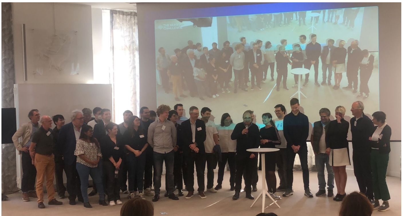
The closing ceremony