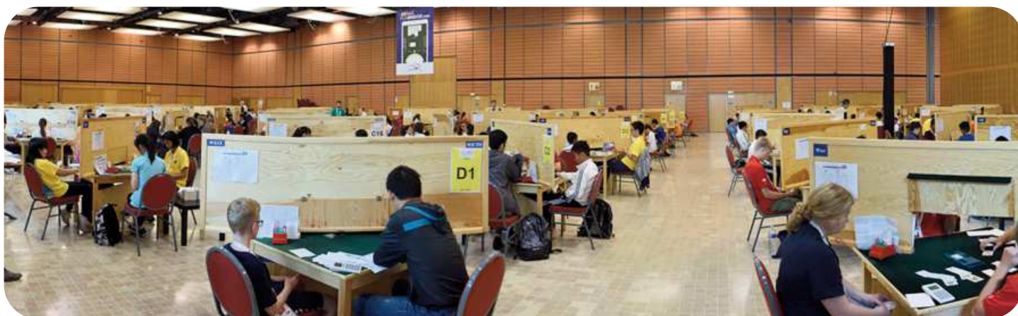
Play got underway in four categories of Youth pairs on Wednesday as contestants in the Junior, Youngsters, Kids and Girls pairs started their quests for championships in Lyon

After the first day of qualifying in the four Youth pairs contests, China has a major presence in the standings, with 90 pairs set to resume play today in the four categories – Junior, Youngsters, Kids and Girls. All pairs have played three qualifying sessions so far.